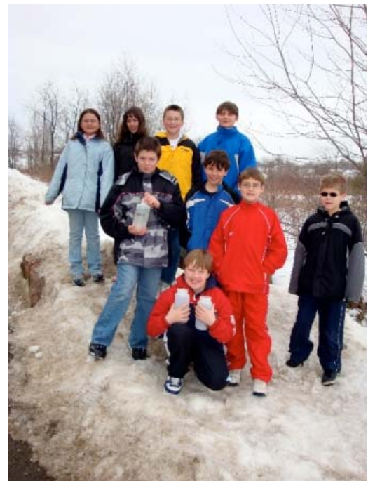
Slippery Rock Elementary School students braving the weather to test their creek.