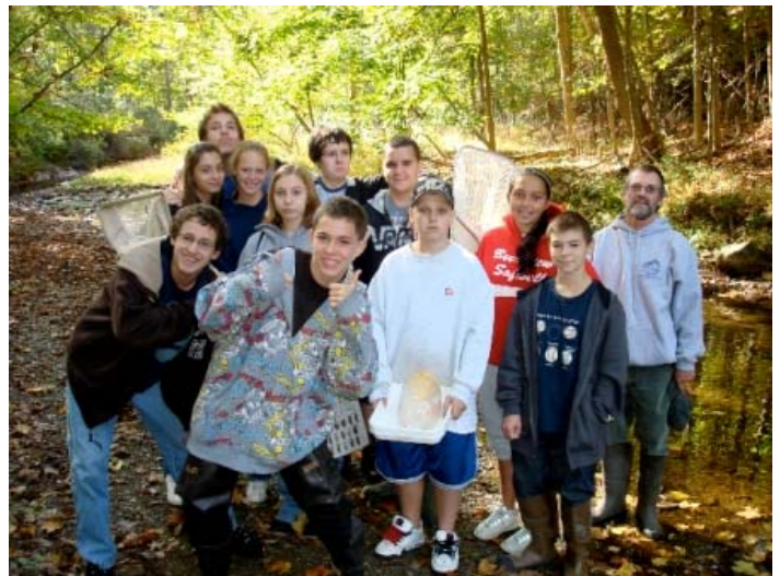
Pittsburgh Brashear High School students visiting their creek.