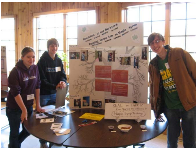
Students from Seneca Valley IHS show off their project.

addition to these winners, three more t-shirts were awarded to students from Shady Side Academy, Gateway Middle School and Pittsburgh Perry High School who won the Creek Connections t-shirt contest, where they had to correctly guess the animal displayed on the shirt. Everyone appeared to have a fantastic day, and students left with a plethora of new and exciting information about the environment they live in.