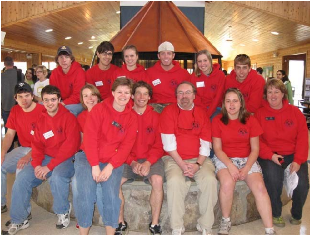
Creek Connections staff thanks you for another successful Creek year!

TO SEE MORE FULL COLOR PHOTOS FROM THIS YEAR'S SYMPOSIA: http://creekconnections.allegheny.edu/symposia.html