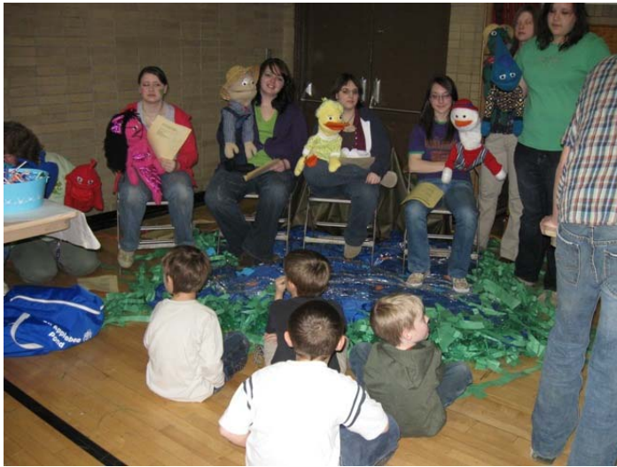
Students performing an environmental puppet show for younger students at the Youngsville High School symposium.