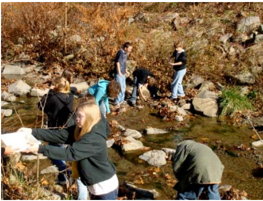
Gateway Middle School students visiting their creek.