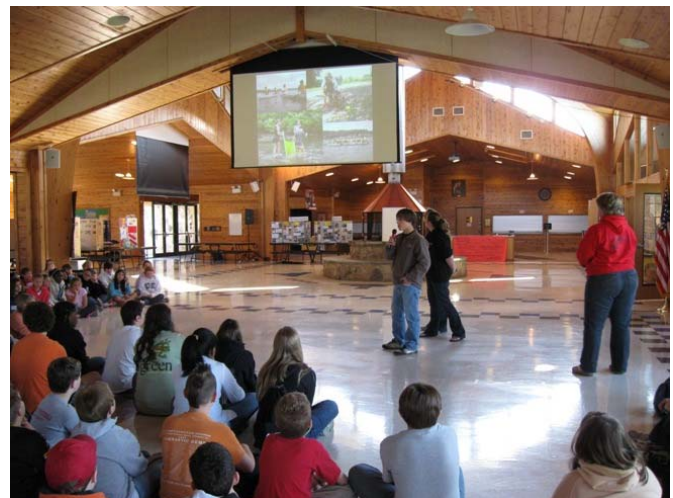
Former Creek Campers talk about what they did at camp and encourage students to attend this year.