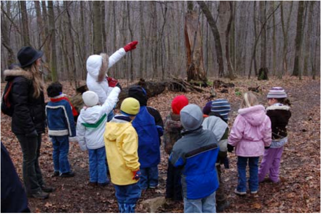
Above: Seneca Valley High School advanced biology students lead kindergarteners into the "wild" for hands-on learning.

Pittsburgh Area Symposium - pg. 2 Allegheny College Symposium - pg. 3