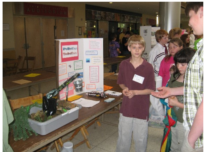
Above: A Conneaut Lake Junior High School student shows off his interactive project to other attending students.