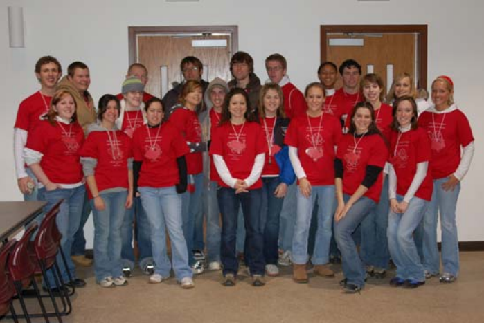
Above: Seneca Valley High School advanced biology students who put on the nature program for a local Kindergarteners.

We are hoping that this field trip will continue for many years to come and possibly expand to other elementary schools as well. In a world where we are competing daily with television and video games, it is important to expose young children to the outdoors and show them there is just as much excitement there as the TV screen! Thanks again Creek Connections for all your wonderful modules!