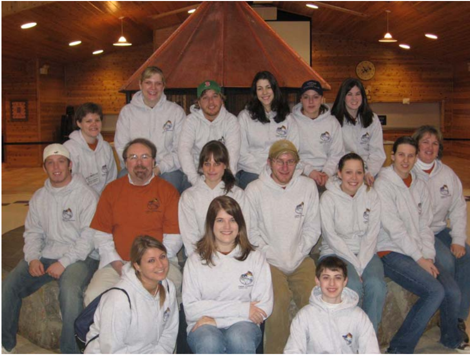
Creek Connections staff ready for the day at Camp Kon-O-Kwee! Thanks for a great year!

YOU CAN VIEW A FULL COLOR VERSION OF THIS NEWSLETTER ON OUR WEBPAGE AT: http://creekconnections.allegheny.edu/Newsletters/May2007Issue.pdf