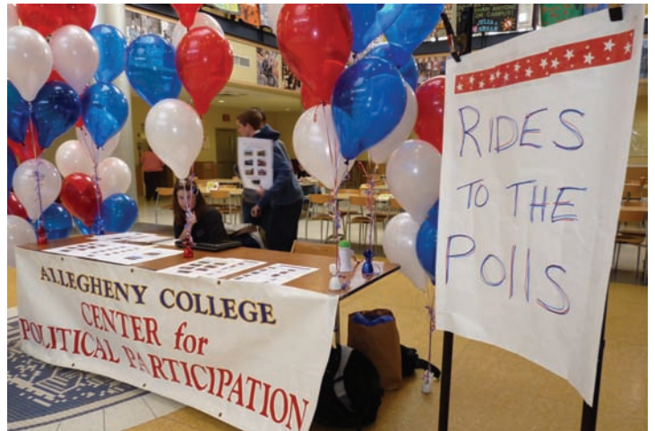
Bottom: The CPP offered Allegheny students rides to the polls for the midterm elections in November 2010.