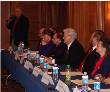
Crawford County Commissioner candidates take part in a political forum in the Tipton Room of the Tippie Alumni Center.

With the help of the Crawford County League of Women Voters, the CPP hosted a forum for the candidates for Crawford County commissioner on Wednesday. All 11 candidates attended the event, where they discussed local issues, such as economic development and regional planning. The candidates also spoke of what their priorities would be if elected to office and their qualifications for the position. Students and community members attended the forum, which was held in the Tippie Alumni Center.