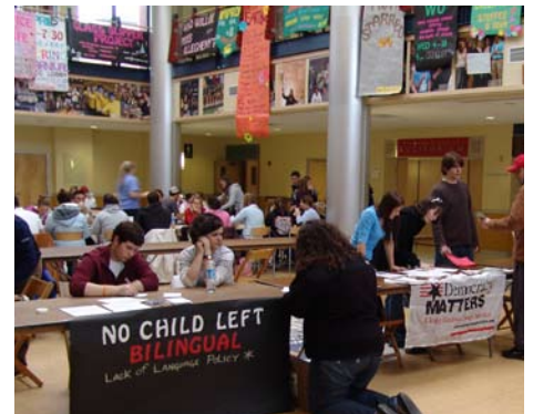
Allegheny student groups encourage their peers to get active by writing letters and signing petitions.

Students and community members were encouraged to come to the Campus Center lobby to write letters and sign petitions on a variety of issues. Many student organizations, such as the College Democrats and College Republicans, set up tables advocating various political and social issues. Hundreds of letters were mailed to state and national decision-makers.