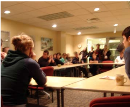
Students participate in a lively discussion after watching the film Jesus Camp .

The week began in Shafer Auditorium with a showing of the documentary Jesus Camp , which details the influence of evangelical Christians in politics. Following the film 50 Allegheny students discussed the political implications of the activism practiced by this select group of citizens.