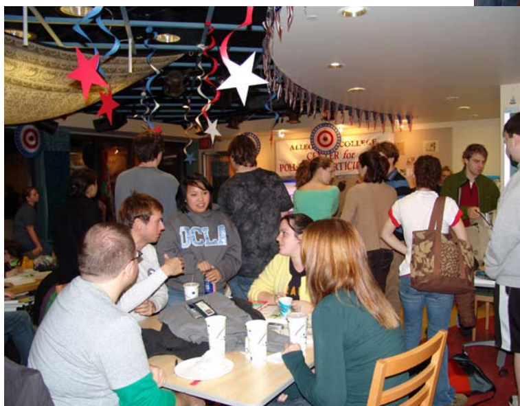
Students enjoy refreshments and discuss the incoming election results.

The CPP also provided a shuttle on Election Day to transport registered Allegheny students to and from local polling places. Students were strongly encouraged to register in Meadville this year in order to ensure ease of voting and strong turnout.